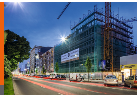
The Black Pearl included a lot of intricate glass work that Prime Construction handled expertly