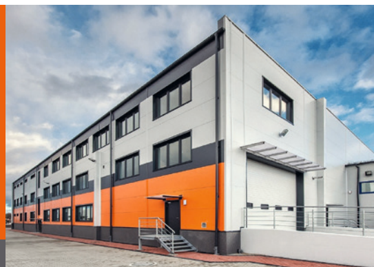
The extension of KK Wind Solution's factory was completed while the factory stayed active